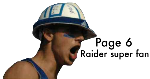
Page 6 Raider super fan