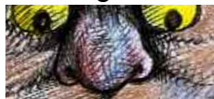
Page 4 Where are the Wild Things?