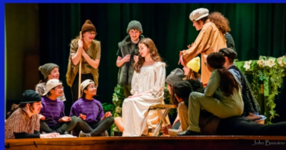
Terrill Middle School Players presented Peter Pan Jr.