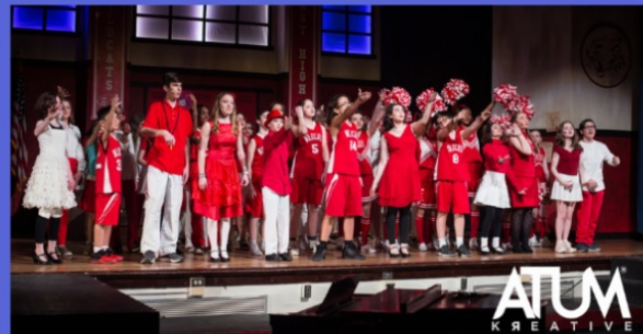
Nettingham Performing Arts Company presented High School Musical Jr.